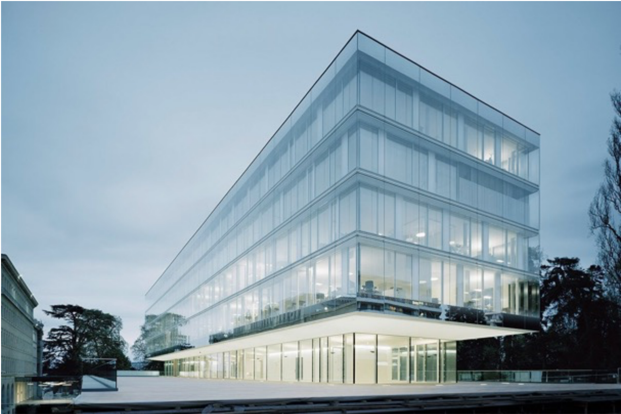
WTO The World Trade Organization