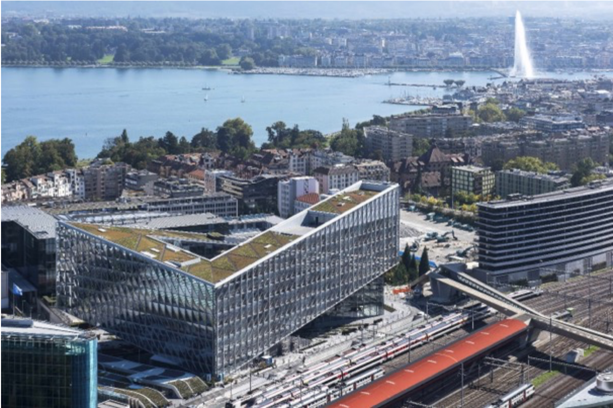
World Headquarter of Japan Tobacco International (JTI)