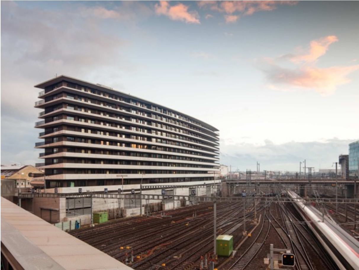
Student Housing de Picciotto