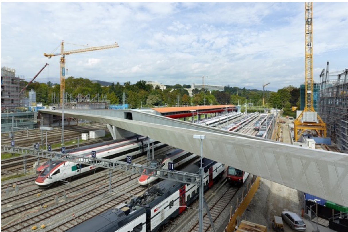
La Paix Footbridge