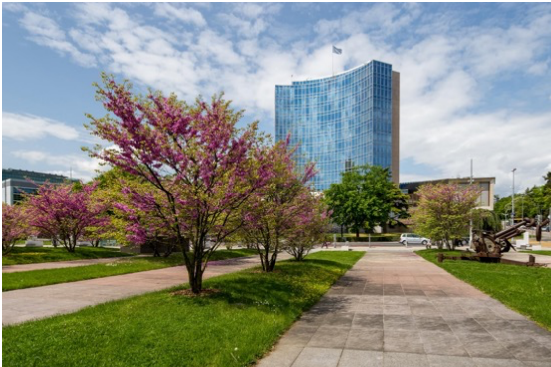
WIPO World Intellectual Property Organization

This is a walking tour. Make sure to wear comfortable shoes and clothing according to the weather, and to carry your transport card