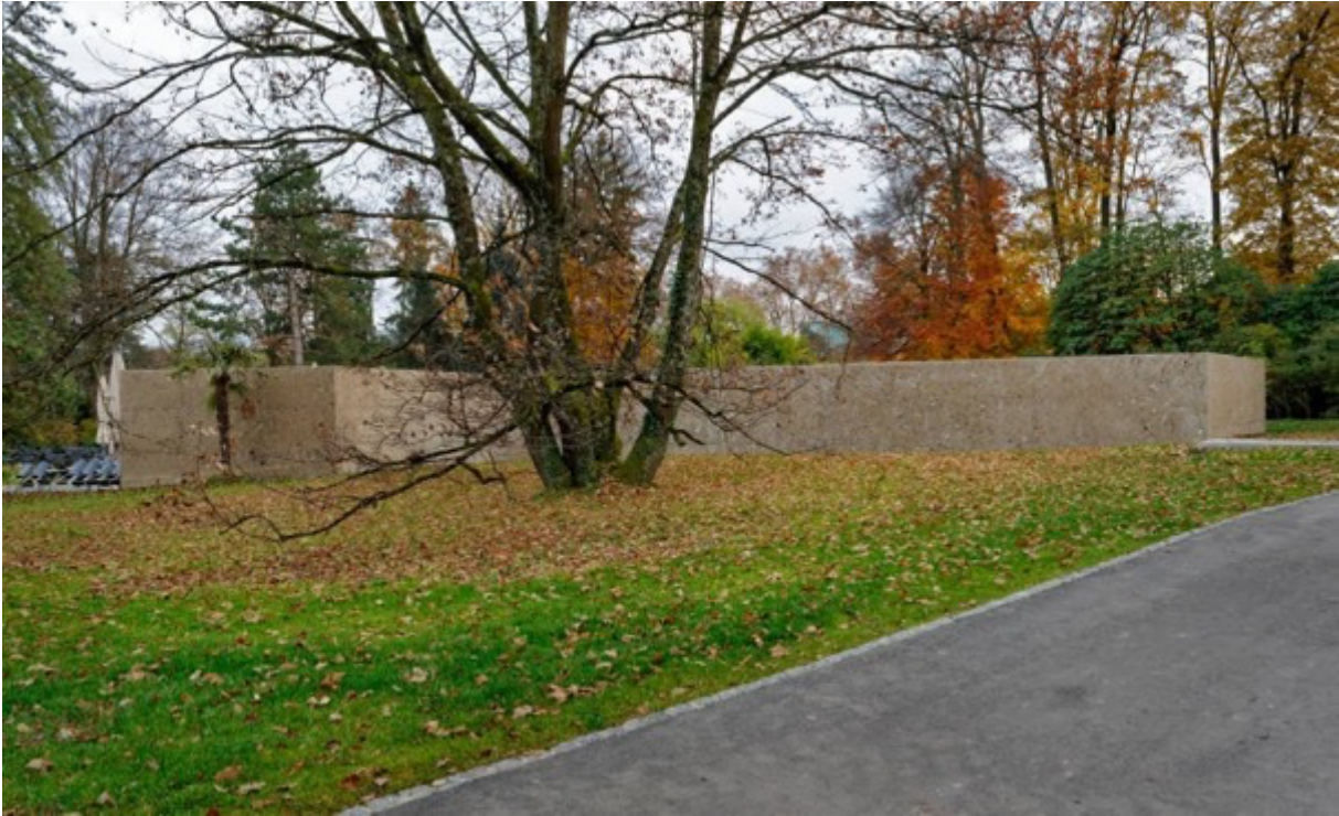
Botanical Garden Conservatory