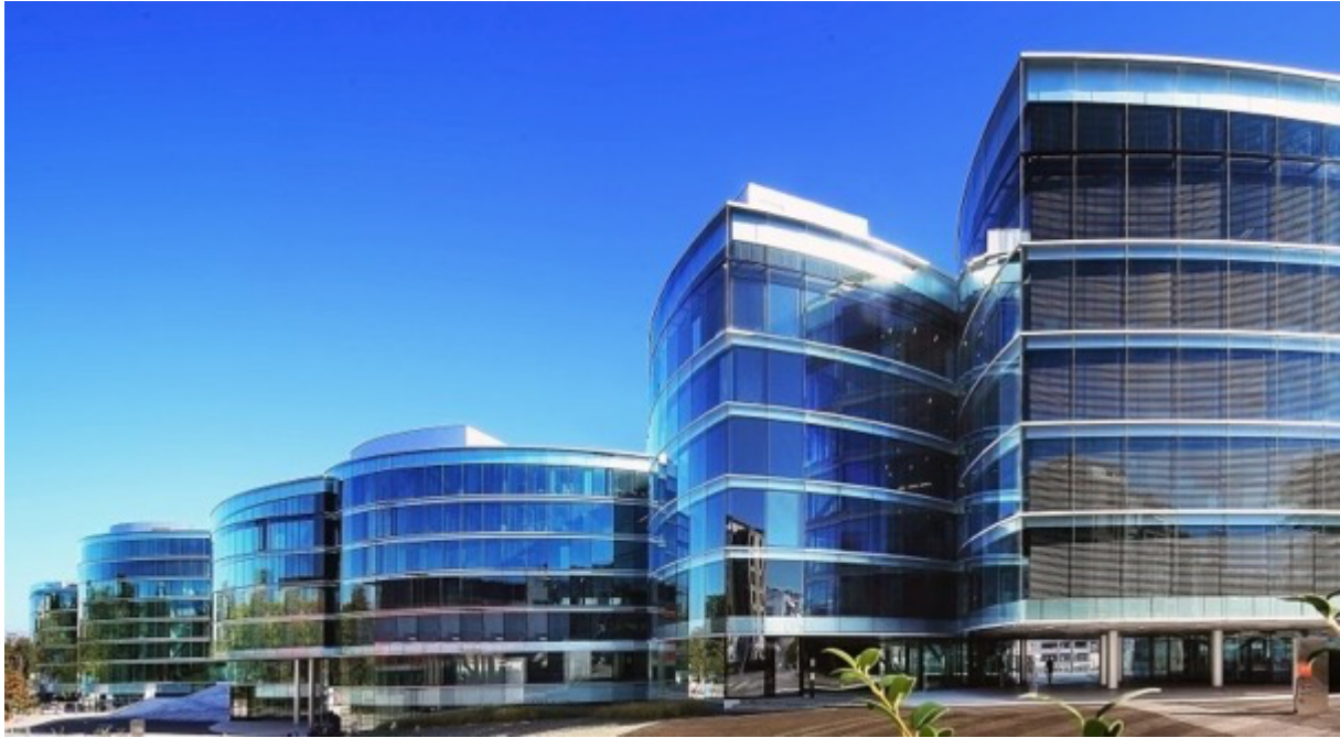
Maison de la Paix